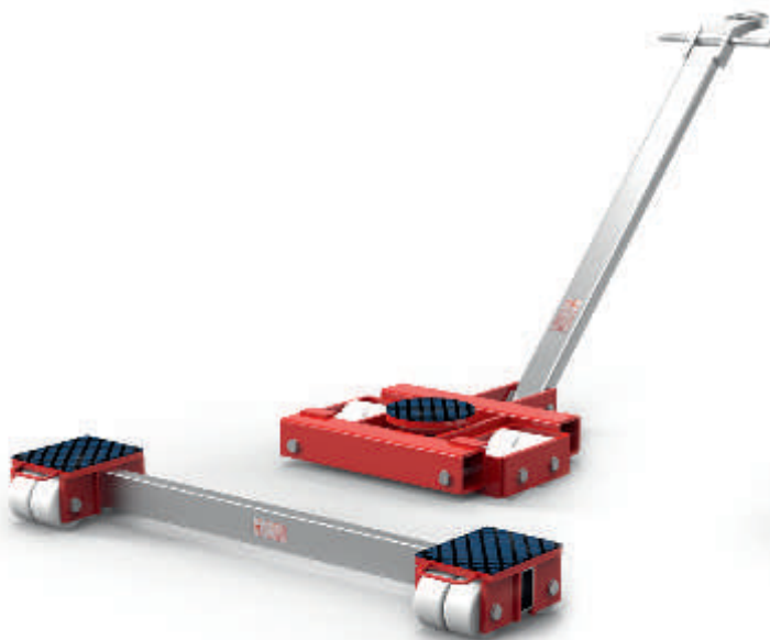
F20 / L20