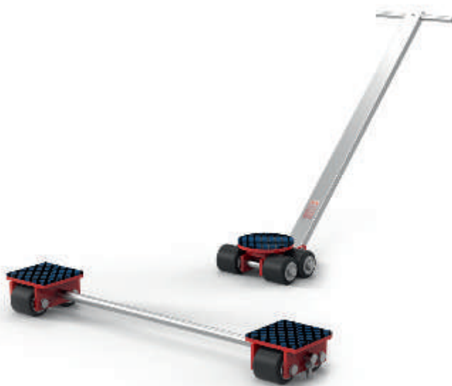
F3 / L3