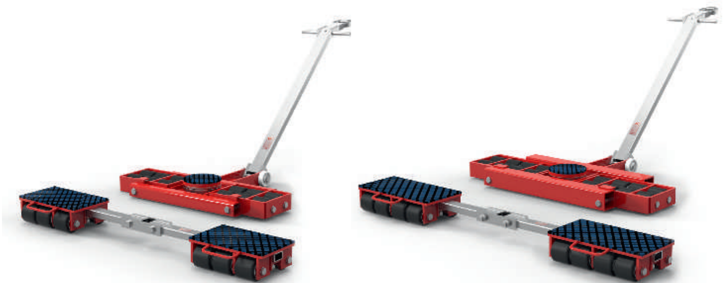
F9 / L9