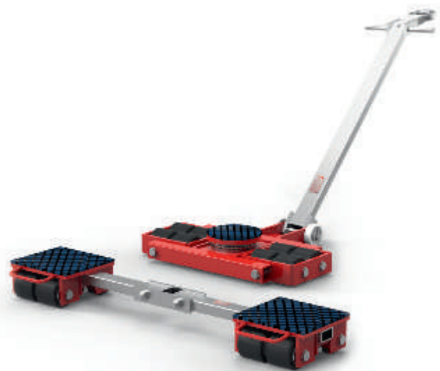
F6 / L6