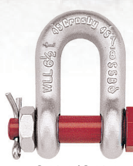
G-2150 / S-2150

Bolt Type chain shackles with thin hex head bolt - nut with cotter pin. Meets the performance requirements of Federal Specification RR-C-271F Type IVB, Grade A, Class 3, except for those provisions required of the contractor. For additional information, see page 452.